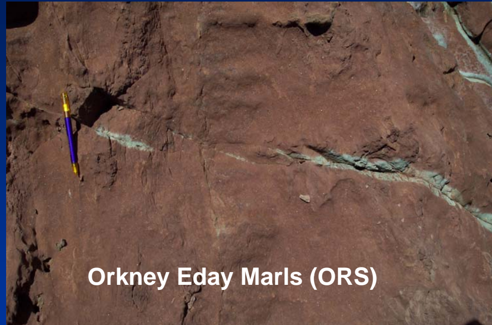
Orkney Eday Marls (ORS)